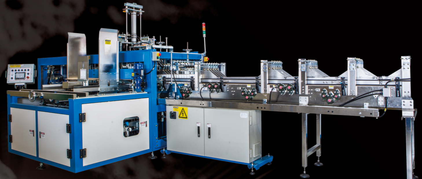
SFA-2125-L (PULL TYPE)